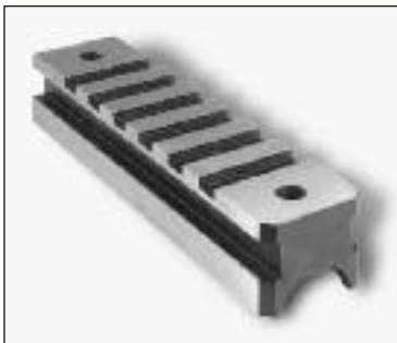
Optional Long Base Jaw