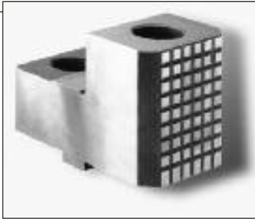
One Step Top Jaw